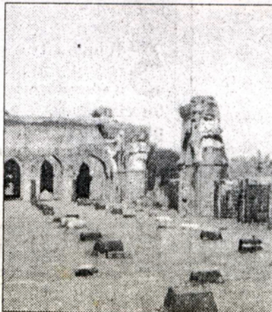
Ruins of the mosque. Text and photographs by SOMEN SENGUPTA

However, years of negligence have wreaked havoc with the mosque. Out of 306 domes on the original structure, only 18 remain. Archaeological Survey of India finally came to the rescue of the mosque but its efforts have to be supplemented by that of the state government so that this landmark of history can withstand the ravages of time.