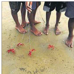
■ Mandarmani beach is known for red crabs, which are found in plenty there. (Top) A spot to relax on the beach.